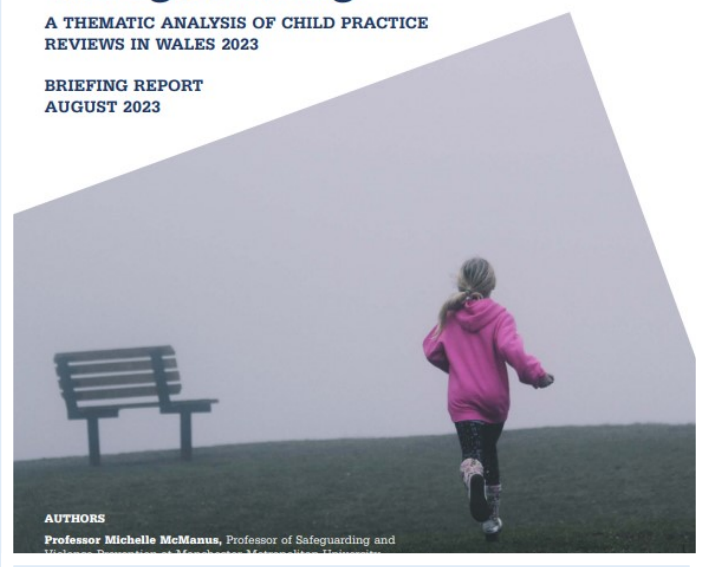
Report: Multi-Agency Safeguarding A Thematic Analysis of Child Practice Reviews in Wales

Risk, Response and Review: Multi-Agency Safeguarding