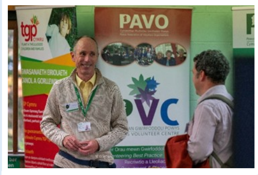
Attendees at Regional Conference hosted by Powys at the Royal Welsh Showground