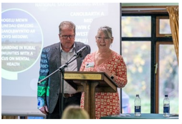
Presenters at Regional Conference hosted by Powys at the Royal Welsh Showground

A VAWDASV Strategy Launch webinar offered an outline of the new strategy and also shared information in relation to regional work around Perpetrator Intervention, IDVA Service provision, regional awareness raising campaigns and the findings of a thematic review of our regional Domestic Homicide Reviews. The webinar also offered delegates an opportunity to hear from Survivors, Practitioners, and Providers who shared their experiences.